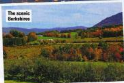
The scenic Berkshires

The Colonnade Hotel in the fashionable Back Bay district offers the city's only rooftop pool (Colonnadehotel.com). The views from here are stunning and you can visit the nearby Skywalk Observatory to get even higher up.