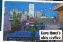
Cova Hotel's chic rooftop