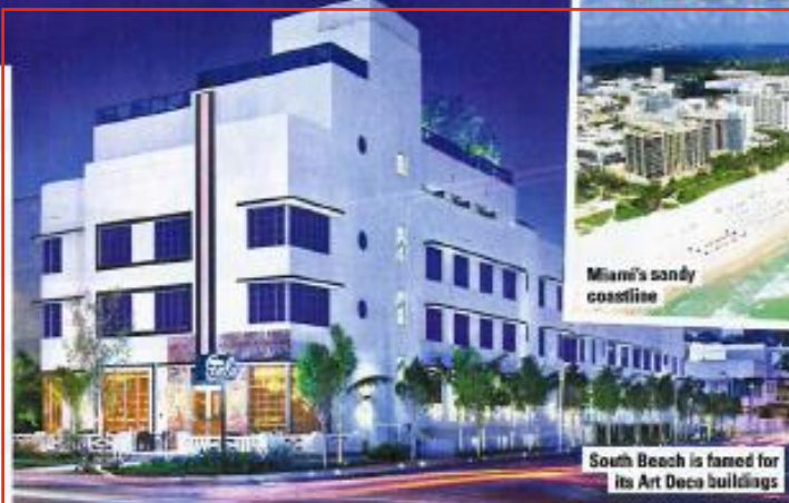
Miami's sandy coastline

The Gale hotel in Miami is perfectly located in the heart of South Beach, just a short stroll from the sea and the Lincoln Road shopping mall. There's a cute rooftop pool and a fab free shuttle service to ferry you to the bars and