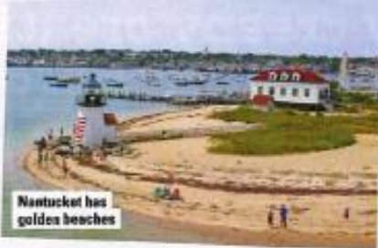
Nantucket has golden beaches

You'll also find excellent eateries like the Summer Shack on your doorstep.