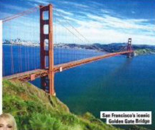
San Francisco's iconic Golden Gate Bridge

Cova Hotel in downtown San Francisco is close to the shopping hub of Union Square. We loved the chic roof terrace and the make-your-own waffles at breakfast. Rooms start at £130, see Covahotel.com.