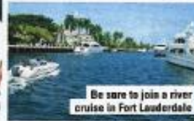
Be sure to join a river cruise in Fort Lauderdale

Take a trip to BG Whiskey Creek Hideout, where you can join a kayak or paddleboard tour along the waterways that were frequented by smugglers during the Prohibition, hence the